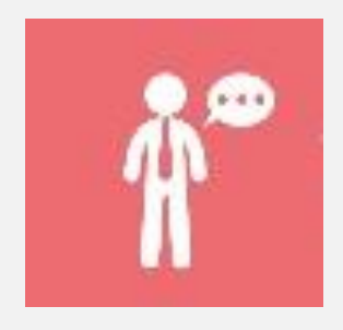
Communication in the mother tongue